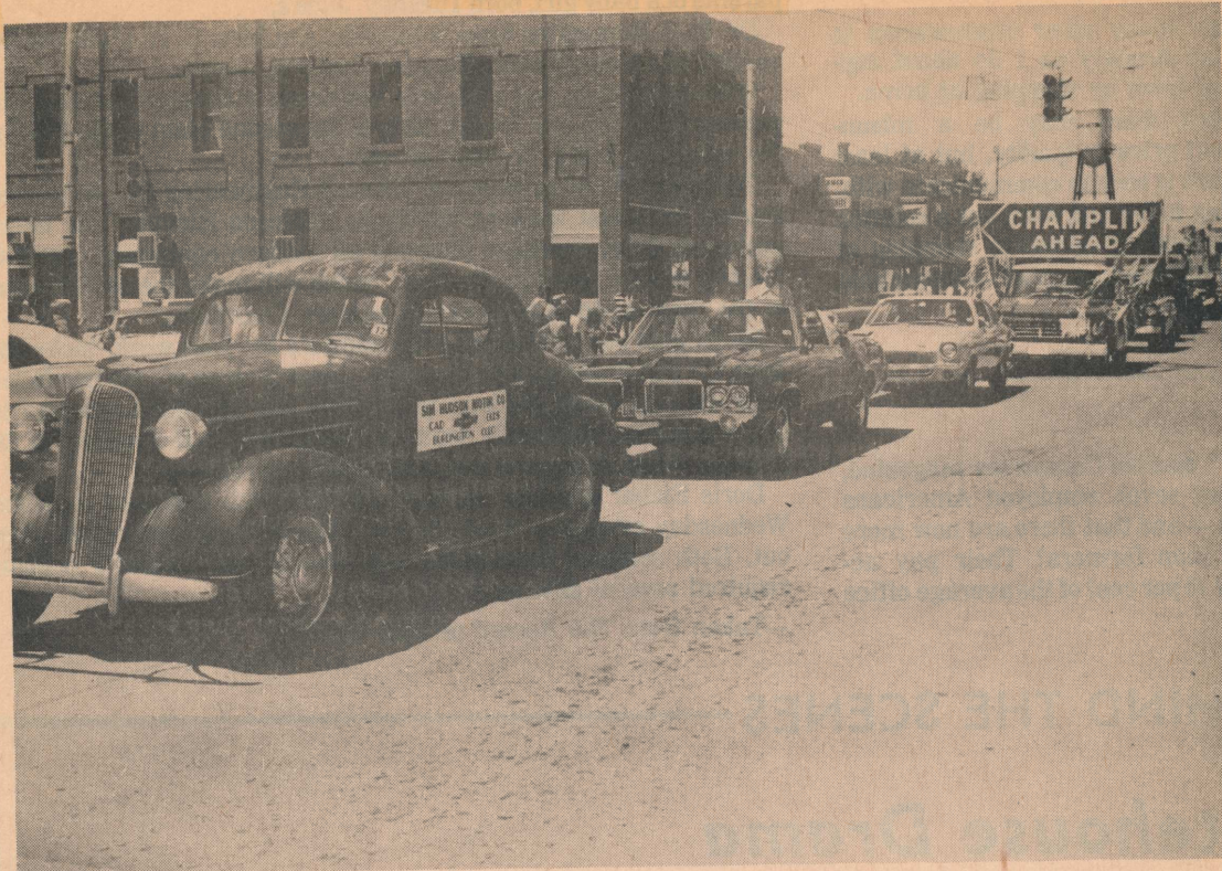
Portion of the long line of cars, both old antiques and new autos, is shown above. Parade lasted approximately 30 minutes as it started on the north end of 14th St. and went by the hospital returning to 14th and Senter Sunday afternoon.